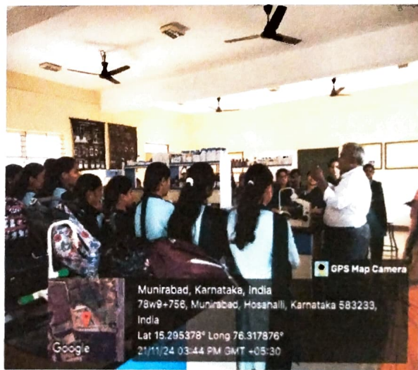
Students at Soil science department, College of Horticulture, Munirabad.