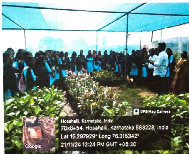
Scientist explaining to the students about the maintenance of green house of Medicinal plants, fruit crops and grafting techniques.