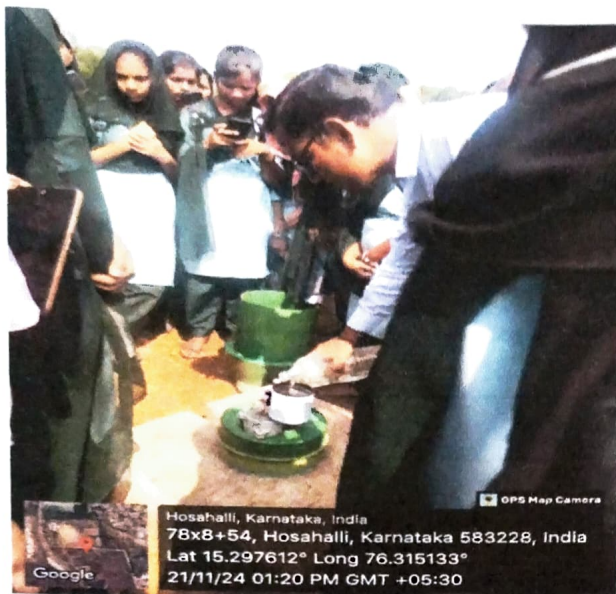
Scientist explaining to the students about the weather instruments in the college campus.